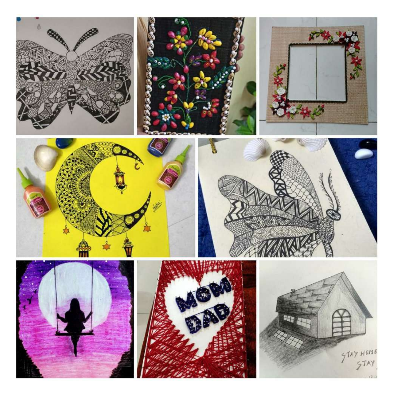
Lockdown period learnt new art, develop hobbies and new skills

https://www.facebook.com/100057237738254/videos/pcb.230041775 6930398/530072804335235