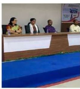
Felicitation of Guest