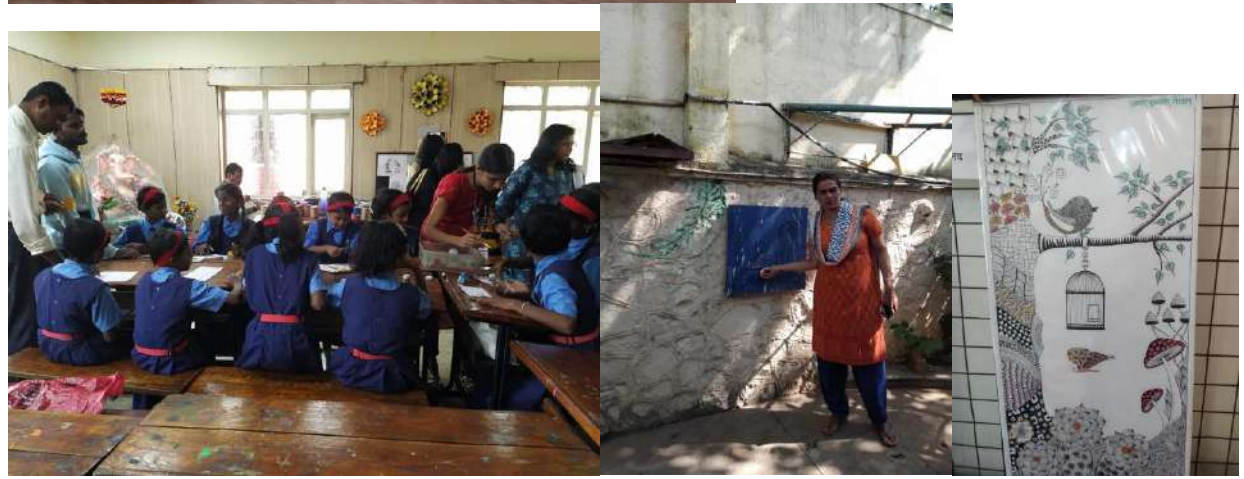
Making CRAFT ACTIVITIES by School Students

https://www.facebook.com/photo/?fbid=2179035432401965&set=pcb.2179036299068545