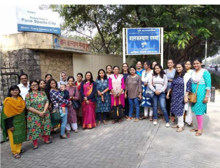
Visit to Balkalyan sanstha in Aundh, Pune